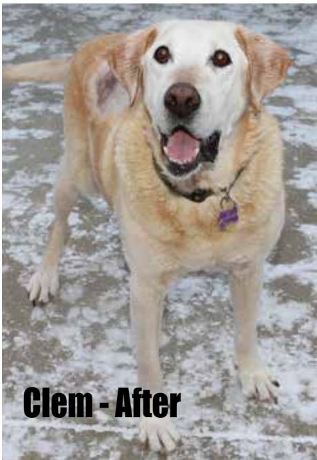
Clem - After