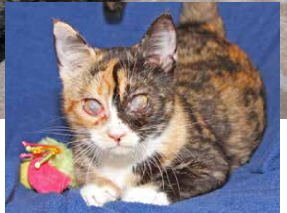
Nita - Before