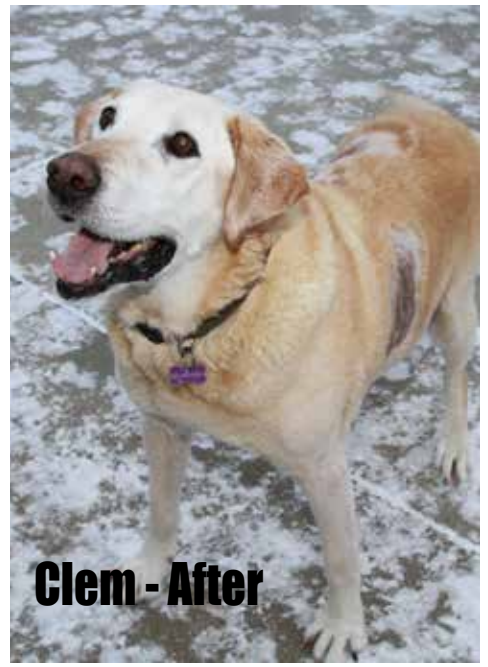
Clem - After