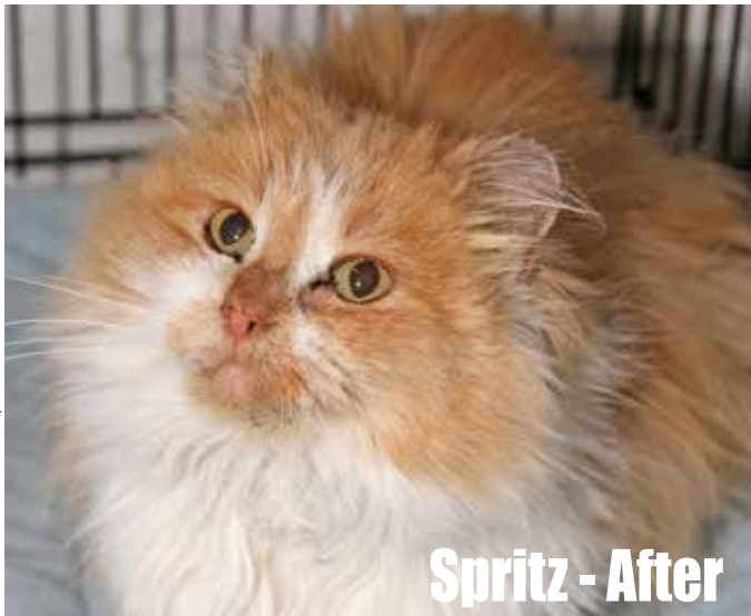
Spritz - After

Animal shelters everywhere dread these weather extremes, and know what kind of suffering and possibly