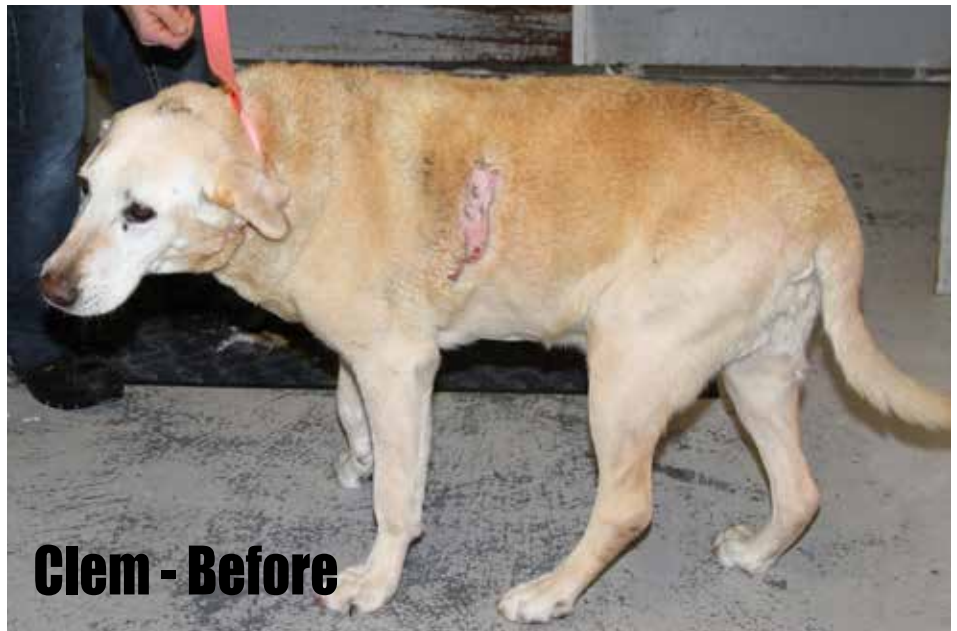
Clem - Before

Spritz wandered into a Mandan garage during sub-zero temps, and the homeowners were able to capture her and bring her to us. (I call her "her" but really she could be