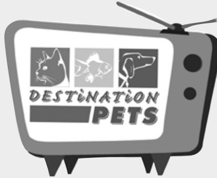
Produced by Central Dakota Humane Society and Dakota Media Access

Also available online at dakotamediaaccess.org and cdhs.net .