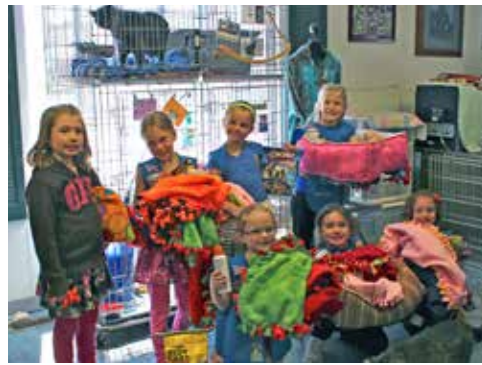
🐾 Thank you to Northridge Elementary First-Grade Daisy Girl Scout Troop #83199. These girls brought in polar fleece tie blankets and other items for the shelter. Thank you!