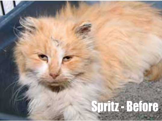
Spritz - Before

a "he." Spritz is a wild little urchin who is not yet convinced that we are better than life on the streets!) We have managed to burrito wrap "her" in a towel for a quick vet check and long lasting antibiotic injection but that is about the extent to which we have been allowed to handle her. Her badly swollen, flame-red ears have fallen off, and her foot pads were frozen and damaged as well. We can see a healing wound on her forehead, but really have not been able to examine her as of yet. She has been doing a lot of snoozing in warm blankets and lots of eating which makes us happy and hopeful. Spritz is one of several new arrivals that have an extra hurdle