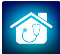
Dakota Home Care