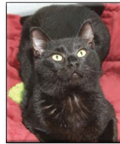
NALA Spayed Female Short Hair (DSH) Black Approximate DOB: January 2018