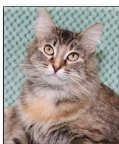
LORETTA Unspayed Female Medium Hair Brown Tabby Approximate DOB: November 2017