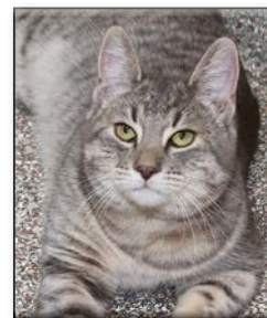
MURRAY Neutered Male Short Hair (DSH) Brown Tabby Approximate DOB: July 2019