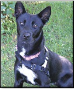
AMELIA Spayed Female Black Lab/Heeler Mix Approximate DOB: August 2018

See more CDHS adoptable pets at www.cdhs.net