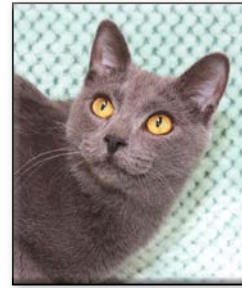
MIDLIN Unspayed Female Short Hair (DSH) Gray Approximate DOB: October 2018