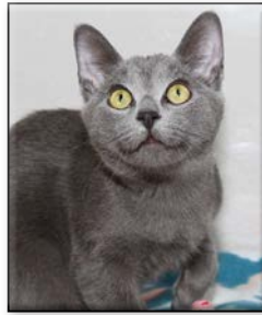
KAZAAM Unneutered Male Short Hair (DSH) Gray Approximate DOB: October 2019