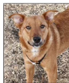
SHENZI Neutered Male Red Heeler Cross Approximate DOB: July 2019