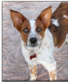
KOVU Neutered Male Red Heeler Cross Approximate DOB: July 2019