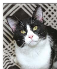
REMI Unneutered Male Short Hair (DSH) Black/White Approximate DOB: July 2019