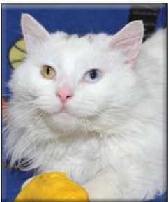
CLARENCE Neutered Male Long Hair (DLH) White Approximate DOB: February 2018