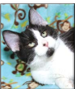
GATES Neutered Male Short Hair (Dsh) Black/White Approximate DOB: July 2019