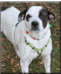
BRANFORD Neutered Male Mixed Breed Approximate DOB: October 2017