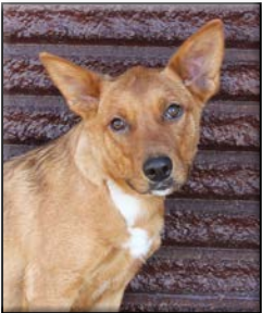
BANZAI Neutered Male Red Heeler Cross Approximate DOB: July 2019