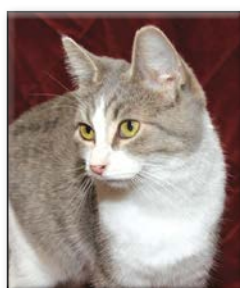
MACKENZIE Unspayed Female Short Hair (DSH) Gray/White Tabby Approximate DOB: April 2019