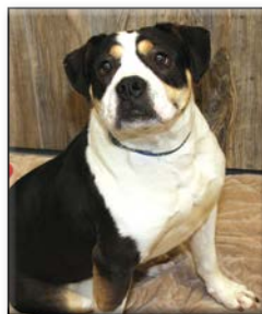
KITANA Unspayed Female Pit Bull Cross Approximate DOB: February 2018