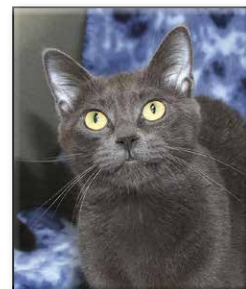
STELLA Spayed Female Short Hair (DSH) Gray Approximate DOB: August 2021