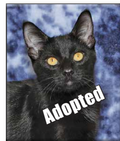
TUVOK Unneutered Male Short Hair (DSH) Black Approximate DOB: April 2023