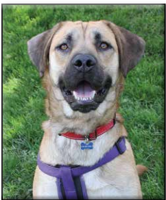
ROMEO Neutered Male Mastiff Mix Approximate DOB: May 2022