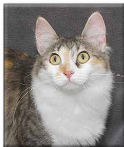
LINZER Spayed Female Long Hair (DLH) Calico DOB: December 7, 2022