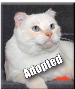
CURRY Neutered Male Short Hair (DSH) Flame Point Siamese Approximate DOB: October 2021