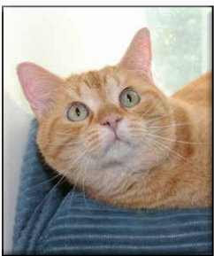
CHEETO Neutered Male Short Hair (DSH) Orange Tabby (Front Declawed) Approximate DOB: July 2017