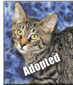
NEELIX Unneutered Male Short Hair (DSH) Gray Tabby Approximate DOB: March 2023