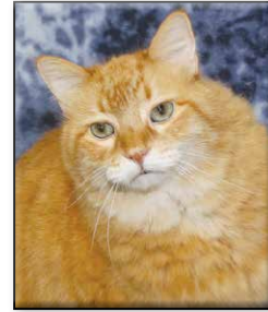
MARTINI Neutered Male Long Hair (DLH) Orange Tabby Approximate DOB: April 2009