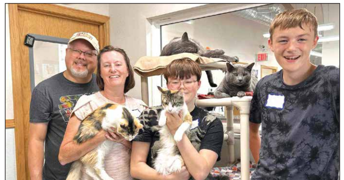
The Springer family

Why is volunteering meaningful to you? We volunteer for a variety of reasons. It feels good to help out the community. After a hard day of work or school, going to the shelter is 'cat therapy.' No matter how tough the day was, you always leave with a smile on your face. It is fulfilling to see the process of change from reactive, negative interactions to positive changes with petting, cuddles and play that will lead to adoptable pets. This teaches us all a lot of patience and care. The kids use the knowledge and skills gained at CDHS in numerous 4-H projects related to dogs and cats, as well.