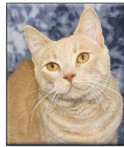
PRETZEL Spayed Female Short Hair (DSH) Buff Tabby Approximate DOB: July 2021