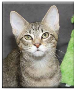
JACK SPRAT Neutered Male Short Hair (DSH) Brown Tabby Approximate DOB: April 2023