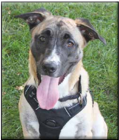
ELMO Neutered Male Mastiff Mix Approximate DOB: December 2022