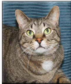
GULLIVER Neutered Male Short Hair (DSH) Gray Tabby Approximate DOB: June 2017