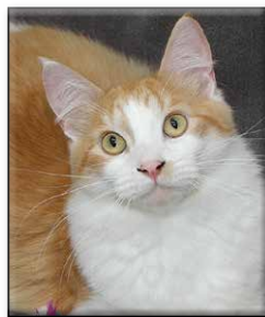
KIPPLEN Neutered Male Long Hair (DLH) Orange Tabby and White DOB: December 7, 2022