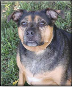
BOSTON Neutered Male Manchester Terrier Approximate DOB: July 2017

See more CDHS adoptable pets at www.cdhs.net