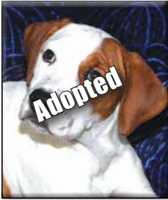
BACALL Spayed Female Bulldog/Hound/ Beagle Mix Approximate DOB: November 2022