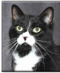
GASTON Neutered Male Short Hair (DSH) Black and White Tuxedo Approximate DOB: March 2016