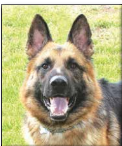
BIFF BARKER Neutered Male German Shepherd Approximate DOB: May 2020