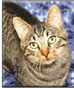
DECKER Neutered Male Short Hair (DSH) Brown Tabby Approximate DOB: March 2022