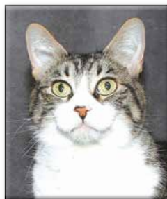
JAFAR Neutered Male Short Hair (DSH) Gray Tabby and White Approximate DOB: March 2016