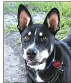
MERLE Neutered Male German Shepherd Mix Approximate DOB: August 2022