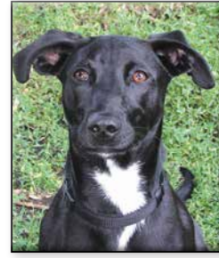
LIBBY Spayed Female Lab Mix Approximate DOB: November 2022