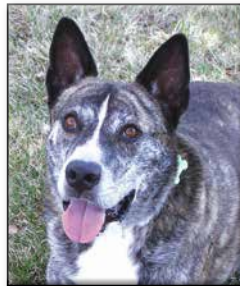
GATOR Neutered Male Mixed Breed Approximate DOB: July 2012