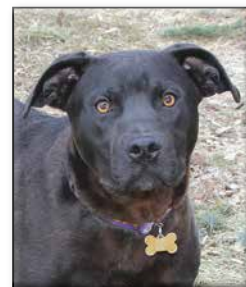
MORK Neutered Male Lab Mix Approximate DOB: August 2022