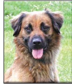
LOWKEY Neutered Male German Shepherd Mix Approximate DOB: April 2021