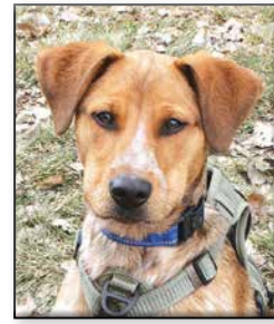
MAVERICK Neutered Male German Shorthair/ Springer Mix Approximate DOB: October 2022