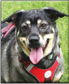
AUTUMN Spayed Female German Shepherd Mix Approximate DOB: June 2021

See more CDHS adoptable pets at www.cdhs.net