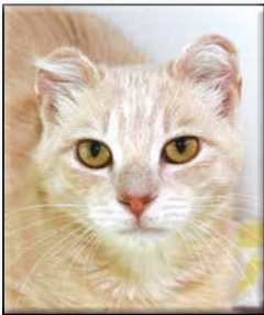
BRENNA FIZZLEBANG Spayed Female Medium Hair (DMH) Buff Approximate DOB: November 2022