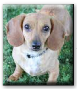
Annastasia Unspayed female, Dachshund

Approximate date of birth: June 2008 Origin: Hoarding situation