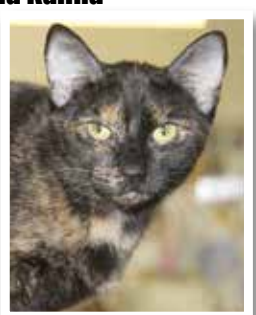
Spark and Volt