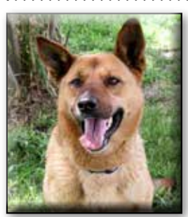
Charlie Unneutered Male Shepherd/Heeler Cross

See more CDHS adoptable pets on the web at www.cdhs.net/adoptablepets.htm