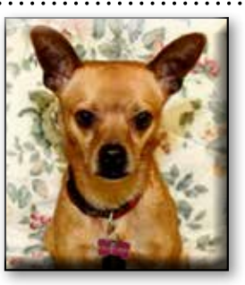
Approximate date of birth: March 2012 Origin: Stray