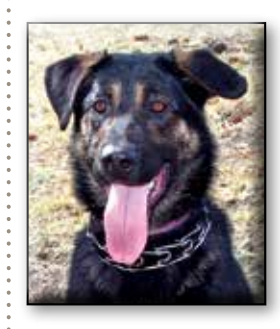
Maximillion Unneutered Male Shepherd Cross Approximate date of birth: September 2015 Origin: Unclaimed Impound