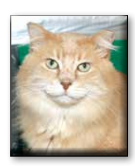
Beemer Neutered Male Long Hair (DLH) Orange Approximate date of birth: April 2012 Origin: Stray