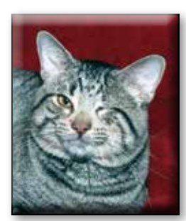
Purrgleton Unneutered Male Short Hair (DSH) Brown Tabby Approximate date of birth: February 2016