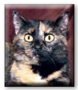
Unspayed Female Short Hair (DSH) Tortie Approximate date of birth: January 2016