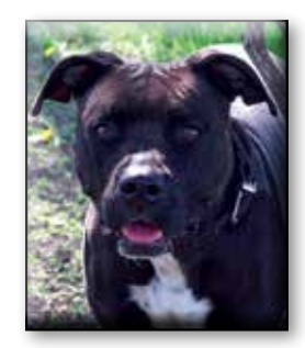
Ava Unspayed Female Pitbull Approximate date of birth: April 2013 Origin: Stray