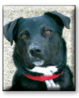
Dude Unneutered Male Black Lab Cross Approximate date of birth: February 2015 Origin: Stray