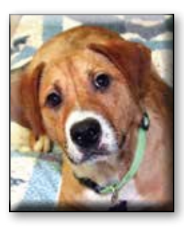
Tevin Unneutered Male Mixed Breed Approximate date of birth: May 2016 Origin: Rescue