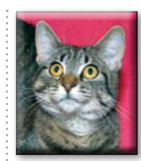
Endora Unspayed Female Short Hair (DSH) Gray Tabby Approximate date of birth: February 14, 2016 Origin: Stray