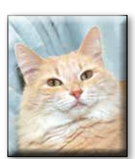
Pattini Unspayed Female Long Hair (DLH) Buff Approximate date of birth: January 2015