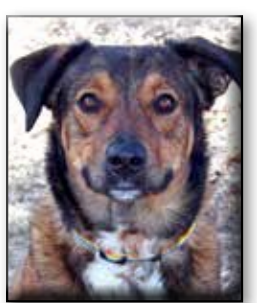
Tank Neutered Male Shepherd/ Rottweiler Cross Approximate date of birth: April 2014 Origin: Owner Surrender