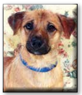
Ablaze Unneutered Male Dachshund Cross Approximate date of birth: July 2016 Origin: Stray