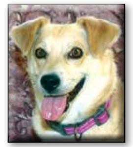
Khloe Spayed Female Puggle Cross Approximate date of birth: October 2010 Origin: Owner Surrender