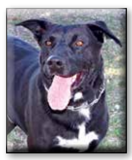
Arlo Unneutered Male Black Lab Mix Approximate date of birth: January 2012 Origin: Stray