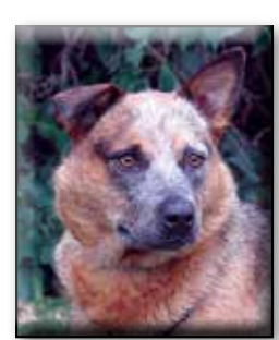
Pugsy Spayed Female Red Heeler Approximate date of birth: June 2013 Origin: Rescue Origin: Abandoned