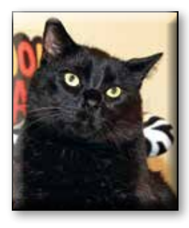
Bleu Neutered Male Short Hair (DSH) Black Approximate date of birth: January 2010 Origin: Stray