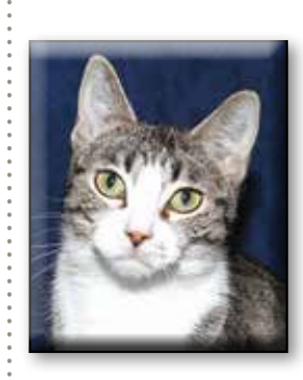
Mrs. Beasley Unspayed Female Short Hair (DSH) Tabby and White Approximate date of birth: January 2016 Origin: Stray