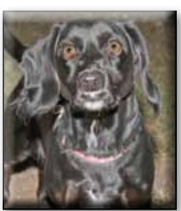
Butler Neutered Male Doxie/Cocker Cross

Approximate date of birth: August 2004 Origin: Owner Surrender