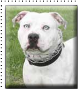
Cash Neutered male Pit Bull

Approximate date of birth: 2007 Origin: Stray