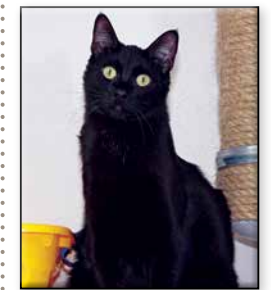
LARK Neutered Male Short Hair (DSH) Black Approximate DOB: April 10, 2018 Origin: Stray