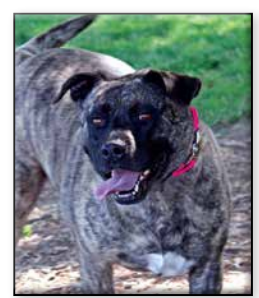
ECHO Spayed Female Pitbull Mix (Brindle) Approximate DOB: September 2013 Origin: Owner Surrender