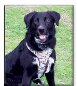
BONKERS Unneutered Male Black Lab Mix Approximate DOB: September 2018 Origin: Stray