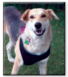
ANTONIA Unspayed Female German Shepherd Cross Approximate DOB: June 2016 Origin: Rescue Transfer