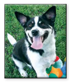
BEE ZEE Neutered Male Border Collie Mix Approximate DOB: June 2018 Origin: Rescue Transfer