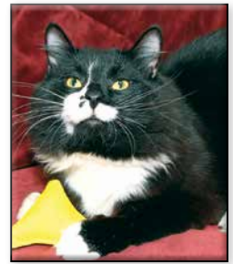
GERALDO Unneutered Male Long Hair (DLH) Black and White Tuxedo Approximate DOB: May 2018 Origin: Stray