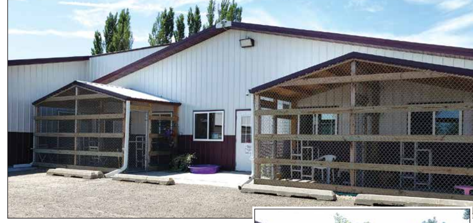
CDHS's new shelter provides a clean, safe, bright environment for pets, staff, and visitors.

Our current building has four outdoor catio spaces. One of the catios is used for cats who reside in the kennels. During morning cleaning, on weather