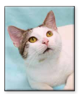
CABBIE Unneutered Male Short Hair (DSH) White/Tabby Approximate DOB: January 2017 Origin: Owner Surrender