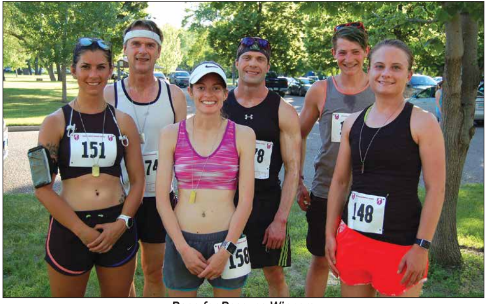
Race for Rescues Winners

More than 130 runners and walkers participated in the 2019 Race for Rescues, raising money for CDHS and enjoying a beautiful evening at Sertoma Park. Having fun and making a difference – it's a great thing!