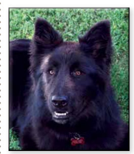
NED Unneutered Male German Shepherd Mix Approximate DOB: September 2018 Origin: Rescue Transfer