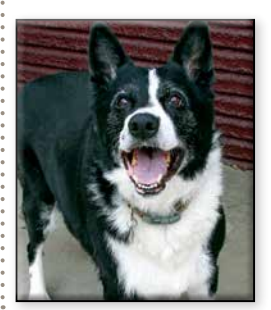
PANDA Neutered Male German Shepherd/ Border Collie Mix Approximate DOB: December 31, 2005 Origin: Owner Surrender