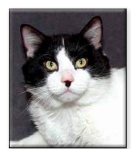
RIESEN Neutered Male Short Hair (DSH) Black and White Approximate DOB: February 2015 Origin: Stray