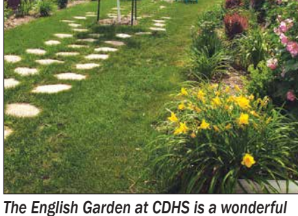
The English Garden at CDHS is a wonderfu place to pause.

If you have not visited our English Garden area (between the shop and the administration/cat building), take a moment to sit a spell. Our dedicated volunteers and staff spend many hours in the summer, beautifying, planting, watering, and weeding to make this space perfect for a moment of respite or reflection. And you can even wave to the kitties in the building who are watching