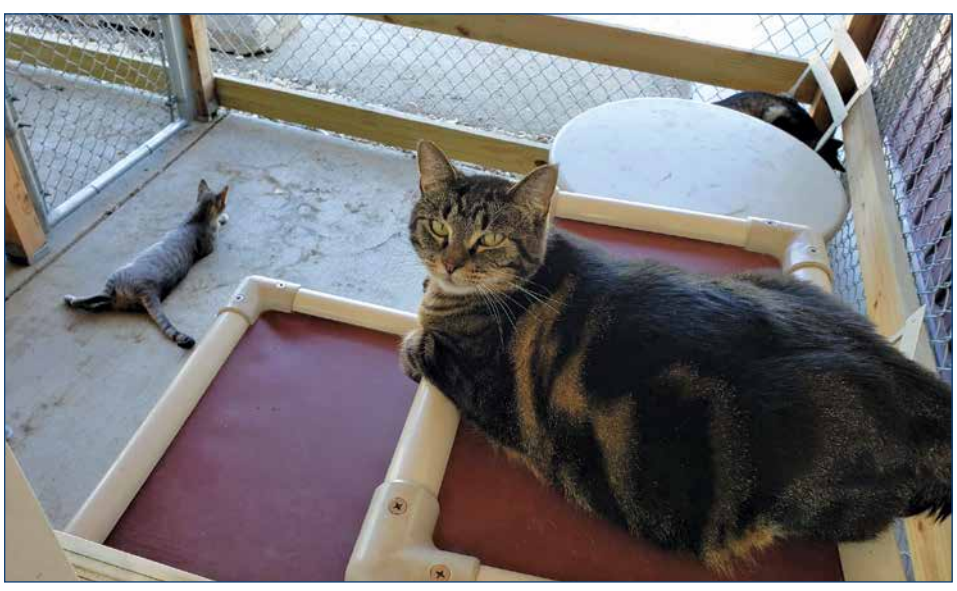
Cats enjoy outdoor time in the newly built catios.

If you have not been out to the CDHS shelter lately, please come and visit. Our shelter is a great place to spend a few hours (or a few hours every week), volunteering or visiting the critters. It could very well be your own happy place.