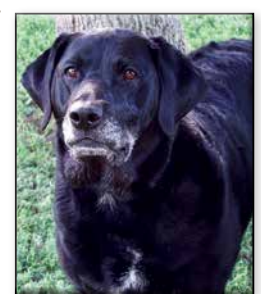
HARLEY Unspayed Female Black Lab Mix Approximate DOB: June 2013 Origin: Owner Surrender