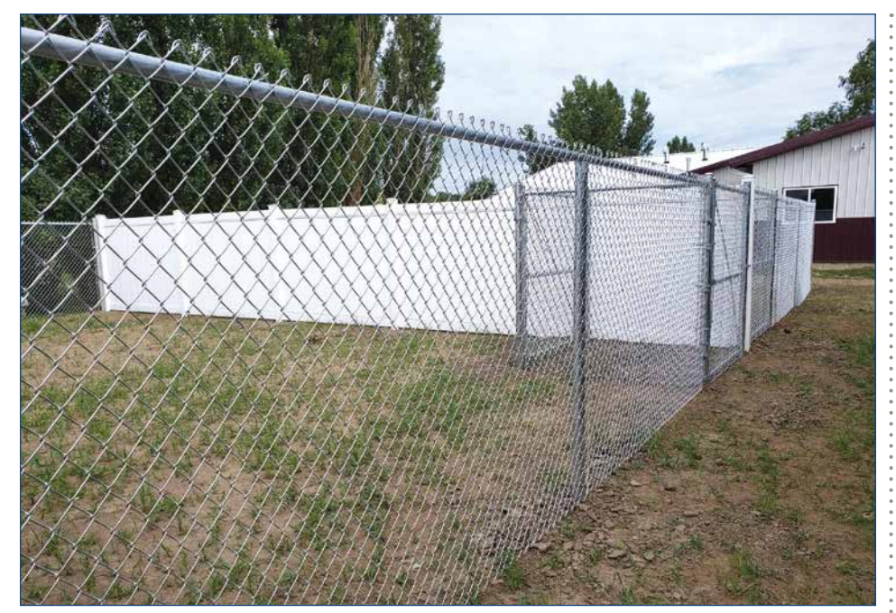
New play yards for the dogs are being built.