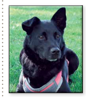
EVITA Unspayed Female Black Lab/Heeler Mix Approximate DOB: May 2017 Origin: Stray