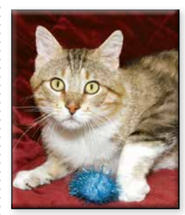
MURDOCH Neutered Male Short Hair (DSH) Brown Tabby and White Approximate DOB: February 2013 Origin: Stray