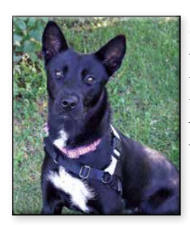
AMELIA Spayed Female Black Lab/Heeler Mix Approximate DOB: August 2018