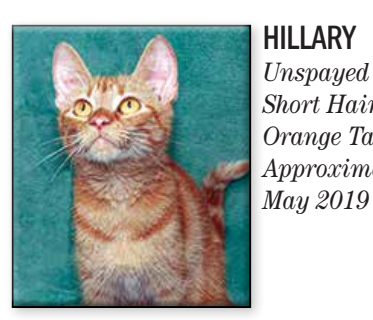
HILLARY Unspayed Female Short Hair (DSH) Orange Tabby Approximate DOB: