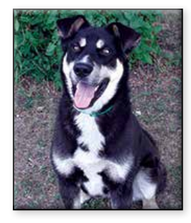
DASH Unneutered Male Husky/Shepherd Cross Approximate DOB: May 2019