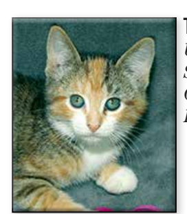
TEAK Unspayed Female Short Hair (DSH) Calico DOB: April 25, 2020