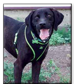
PEPE Neutered Male Plott Hound - Black and Brindle Approximate DOB: July 2014