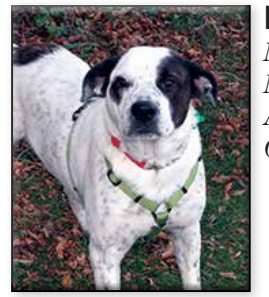
BRANFORD Neutered Male Mixed Breed Approximate DOB: October 2017