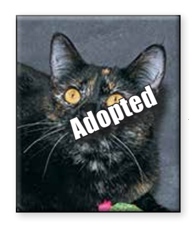
AMBER Unspayed Female Short Hair (DSH) Tortie Approximate DOB: June 2019