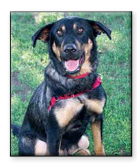
HANSEL Neutered Male Rottweiler Cross Approximate DOB: November 2017