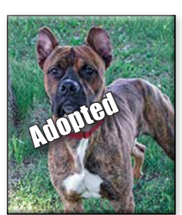
LES PAUL Neutered Male Brindle Boxer Approximate DOB: May 2018