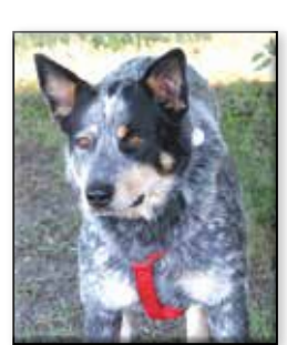
WRANGLER Neutered Male Blue Heeler Mix Approximate DOB: August 2018 Origin: Rescue Transfer