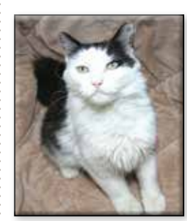
GRANDE Unspayed Female Long Hair (DLH) Black and White DOB: July 2018 Origin: Stray