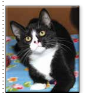
TOFTE Unspayed Female Short Hair (DSH) Black and White DOB: April 2020 Origin: Stray