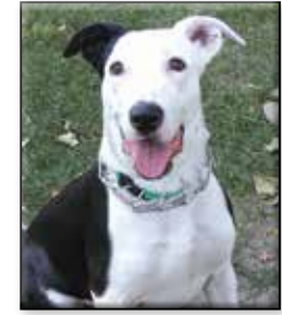
LOXY SHIMMERPOP Unspayed Female Border Collie/Lab Cross Approximate DOB: September 2019 Origin: Stray