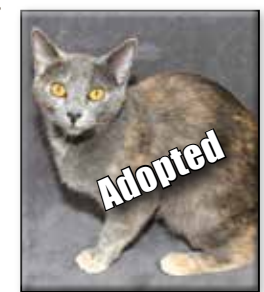
JUNO Unspayed Female Short Hair (DSH) Dilute Tortie DOB: August 2019 Origin: Unclaimed Impound