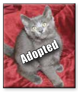
CHICORY Unspayed Female Short Hair (DSH) Gray DOB: June 28, 2020 Origin: Born at CDHS