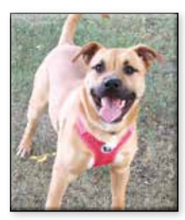
CHEVY Unneutered Male Pitbull/Lab Cross Approximate DOB: January 2020 Origin: Owner Surrender