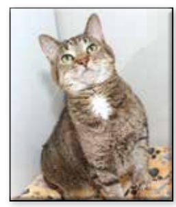
CLOVER Unspayed Female Short Hair (DSH) Brown Tabby DOB: June 2017 Origin: Unclaimed Impound