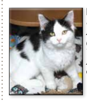
MESABI Unspayed Female Medium Hair (DMH) Black and White DOB: April 2020 Origin: Stray