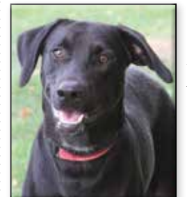
NORBERT Unneutered Male Black Lab Cross Approximate DOB: July 2020 Origin: Stray