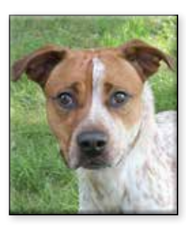
FLACO Unneutered Male Red Heeler Mix Approximate DOB: August 2020 Origin: Stray