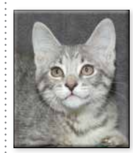
GRANOLA Spayed Female Short Hair (DSH) Gray Tabby Approximate DOB: May 2021