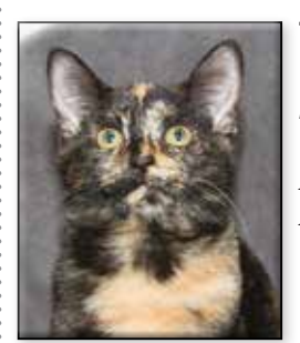
TICO Unspayed Female Short Hair (Dsh) Tortie Approximate DOB: April 2021 Origin: Stray