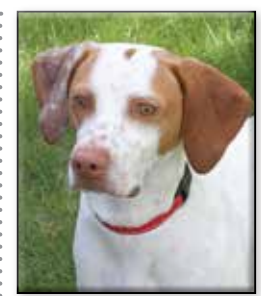
LYNYRD Unneutered Male Pointer Mix Approximate DOB: August 2020