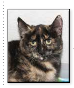
TORRES Unspayed Female Short Hair (Dsh) Tortie Approximate DOB: April 2021 Origin: Stray