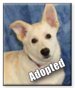
AMERICA Neutered Male German Shepherd Mix Approximate DOB: June 2021