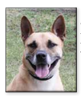
DAPHNE Spayed Female Akita Mix Approximate DOB: July 2015