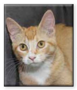
BON JOVI Unspayed Female Short Hair (Dsh) Orange And White Approximate DOB: April 2021 Origin: Stray