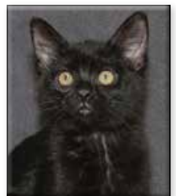
GRAVY Spayed Female Short Hair (DSH) Black Approximate DOB: May 2021