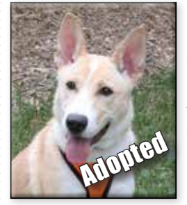
LUNA Spayed Female Border Collie Mix (Tan And White) Approximate DOB: February 2021