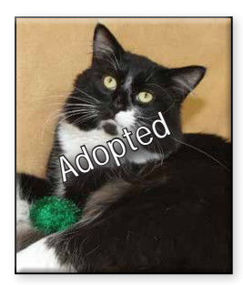
BEETHOVEN Neutered Male Long Hair (DLH) Black and White Tuxedo Approximate DOB: February 2020 Origin: Unclaimed Impound