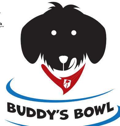
A community program of Central Dakota Humane Society

To fund the program, CDHS will continue receiving pet food donations from several community businesses (dubbed Buddy's Bowl