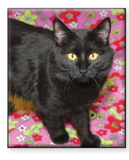
CARPAL Spayed Female Medium Hair (DMH) Polydactyl Manx Black DOB: February 2020 Origin: Unclaimed Impound