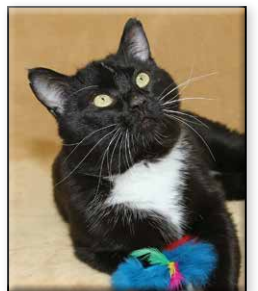
BACH Neutered Male Short Hair (DSH) Black and White Tuxedo Approximate DOB: February 2019 Origin: Unclaimed Impound