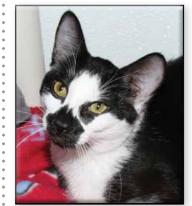
KELCE Unneutered Male Short Hair (DSH) Black and White Approximate DOB: August 2020 Origin: Owner Surrender