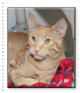
MAHOMES Neutered Male Short Hair (DSH) Orange Tabby Approximate DOB: August 2020 Origin: Owner Surrender