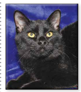
LACHESIS Neutered Male Short Hair (DSH) Black Approximate DOB: February 2020 Origin: Abandoned at CDHS