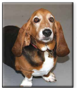
ANDY Neutered Male Basset Hound Approximate DOB: September 2012 Origin: Owner Surrender