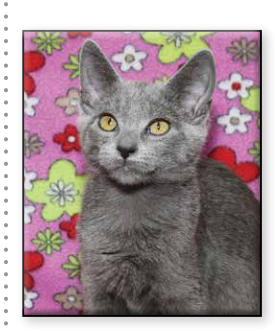
LUNATE Spayed Female Short Hair (DSH) Gray Approximate DOB: November 2020 Origin: Unclaimed Impound