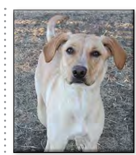
KONA Spayed Female Lab Cross Approximate DOB: January 2020 Origin: Owner Surrender