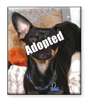
GARRETT Unneutered Male Miniature Pinscher Mix Approximate DOB: March 2022