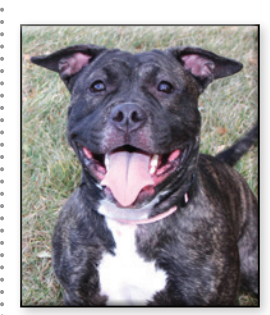
SAVANNA Spayed Female Pitbull Mix Approximate DOB: October 2020