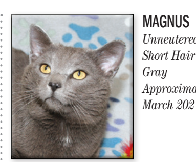
MAGNUS Unneutered Male Short Hair (DSH) Gray Approximate DOB: