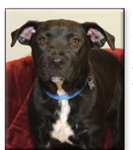
MINDY Spayed Female Lab Mix Approximate DOB: August 2022