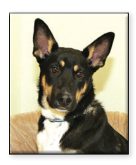
GEORGE Neutered Male German Shepherd Mix Approximate DOB: August 2022

Spayed Female Short Hair (DSH) Brown Tabby Approximate DOB: March 2022