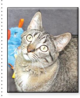
SUNSHINE Spayed Female Short Hair (DSH) Brown Tabby Approximate DOB: March 2022