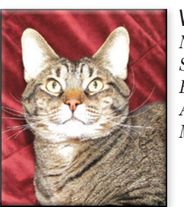
WIGGLES Neutered Male Short Hair (DSH) Brown Tabby Approximate DOB: March 2018