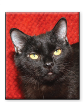
PARTRIDGE Spayed Female Short Hair (DSH) Black Approximate DOB: March 2022