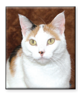
KEIRA Spayed Female Short Hair (DSH) Calico Approximate DOB: January 2020