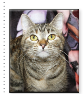
RENO Spayed Female Short Hair (DSH) Brown Tabby Approximate DOB: November 2021