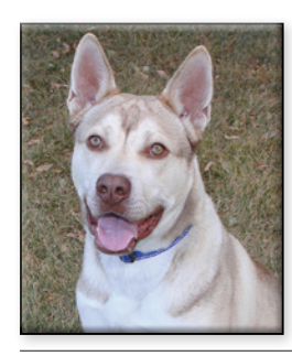
DOMINGO Neutered Male Husky Mix Approximate DOB: October 2020