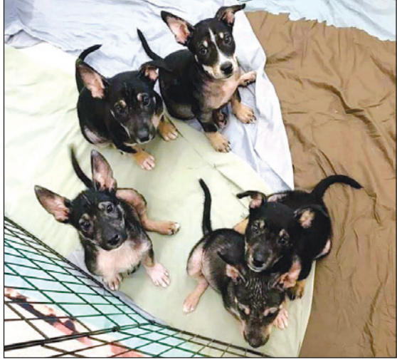
After: George is now sleek, shiny, healthy, and full of puppy energy. All better!