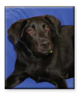
CRISTETA Spayed Female Lab Mix Approximate DOB: November 2020

Unspayed Female German Shepherd Mix Approximate DOB: September 2022