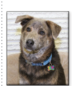
O'DONNELL Neutered Male Mixed Breed Approximate DOB: June 2022