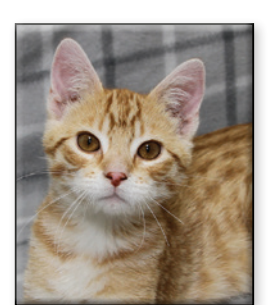
ENZO Short Hair (DSH) Orange Tabby Male: Unneutered Approx. DOB: September 2022

Spayed Female Short Hair (DSH) Snowshoe Siamese -Front Declawed Approximate DOB: March 2013