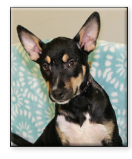
DOLLY Spayed Female German Shepherd Mix Approximate DOB: August 2022