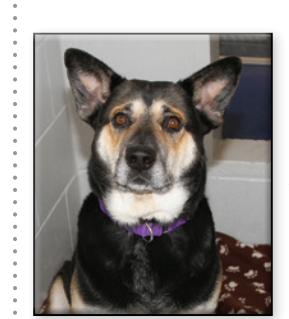
OPIE Neutered Male German Shepherd Mix Approximate DOB: October 2017