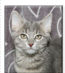
MENTOS Unspayed Female Short Hair (DSH) Gray Tabby Approximate DOB: August 2022