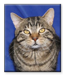
DOC HOLLIDAY (FIV +) Short Hair (DSH) Brown Tabby Male: Neutered Approx. DOB: December 2021