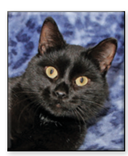
JOHN HARVEY Neutered Male Short Hair (DSH) Black Approximate DOB: November 2022