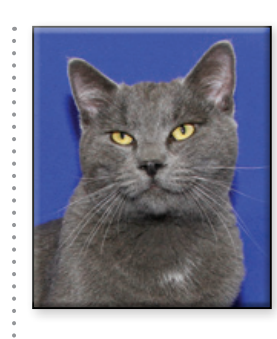
LURO Neutered Male Short Hair (DSH) Gray Approximate DOB: November 2022