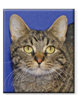
LOUIS Neutered Male Short Hair (DSH) Brown Classic Tabby Approximate DOB: November 2022