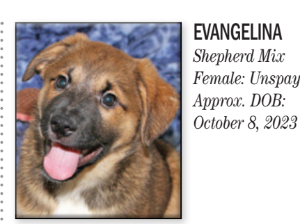
EVANGELINA Shepherd Mix Female: Unspayed Approx. DOB: