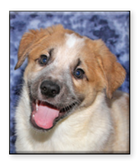
ANGELO Shepherd Mix Male: Unneutered Approx. DOB: October 8, 2023