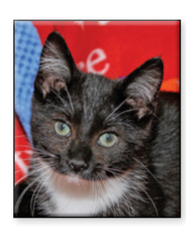
COLUMBO Neutered Male Short Hair (DSH) Black and White Approximate DOB: August 2023