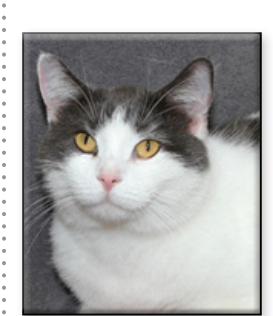
MISS KITTY Spayed Female Short Hair (DSH) White and Gray Approximate DOB: May 2020