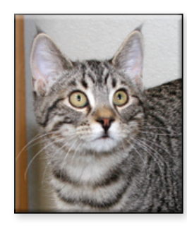
BROCK FIGBLOSSOM Neutered Male Short Hair (DSH) Brown Tabby DOB: August 12, 2023