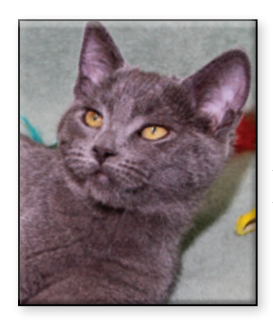
BAYLIN Spayed Female Short Hair (DSH) Gray Approximate DOB: August 2023