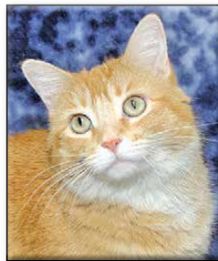
LENA Spayed Female Short Hair (DSH) Orange Tabby Approximate DOB: April 2021