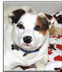
OLIVER Neutered Male Heeler Mix Approximate DOB: October 2022