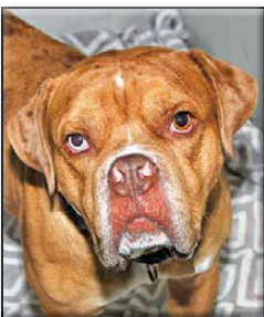
CLAYTON Neutered Male Bulldog Mix Approximate DOB: February 2023