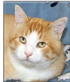
MONROE Neutered Male Short Hair (DSH) Orange Tabby and White Approximate DOB: March 2020