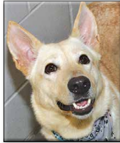
FREYA Spayed Female Corgi/Husky Mix Approximate DOB: June 2019