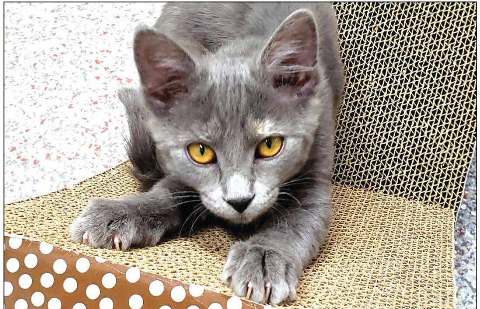
Kitties need to exercise their paws and legs and cardboard scratchers are just the ticket!

of using their litter, some resort to using soft, less painful options, like carpets, piles of laundry, and even the bed or pillows.