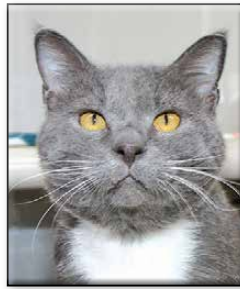
GRISWOLD Neutered Male Short Hair (DSH) Gray and White Approximate DOB: March 2021