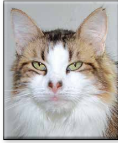
EVELINE Spayed Female Long Hair (DLH) Brown Tabby and White Approximate DOB: March 2016