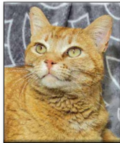
KENO Neutered Male Short Hair (DSH) Orange Tabby Approximate DOB: April 2023