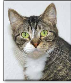
LUCY Spayed Female Short Hair (DSH) Brown Tabby with White Approximate DOB: March 2019