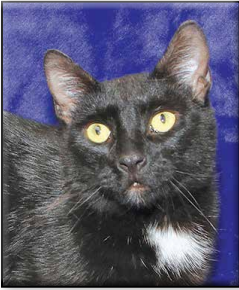
ALDI Spayed Female Short Hair (DSH) Black Approximate DOB: April 2023

See more CDHS adoptable pets at www.cdhs.net