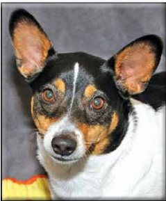
BERNARDO Neutered Male Terrier Mix Approximate DOB: September 2021