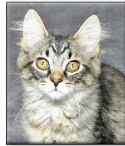
MCFLY Neutered Male Long Hair (DLH) Brown Tabby Approximate DOB: December 2023