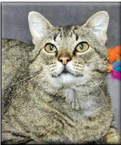
CALLUM Neutered Male Short Hair (DSH) Brown Tabby Approximate DOB: June 2022