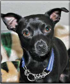
ALFONZO Neutered Male Terrier Mix Approximate DOB: June 2023