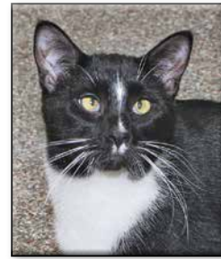
SPOCK Neutered Male Short Hair (DSH) Black and White Tuxedo Approximate DOB: March 2024