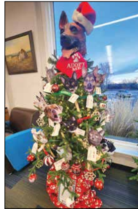
CDHS tree wins 3rd place!