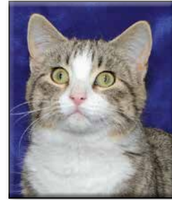
PURRCEY Neutered Male Short Hair (DSH) Gray Tabby with White Approximate DOB: June 2024