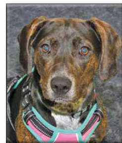
TIGRIS Spayed Female Beagle/Shorthair Mix Approximate DOB: March 2024