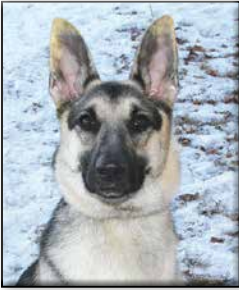
BRIGETTA Spayed Female German Shepherd Mix Approximate DOB: November 2023

See more CDHS adoptable pets at www.cdhs.net