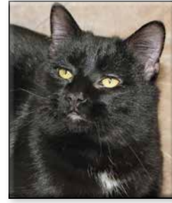
PANTHER Neutered Male Short Hair (DSH) Black Approximate DOB: January 2024