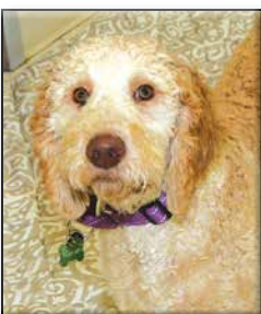
ERNIE Neutered Male Golden Doodle Approximate DOB: June 2024