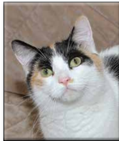
KEIKO Spayed Female Short Hair (DSH) Calico Approximate DOB: July 2024