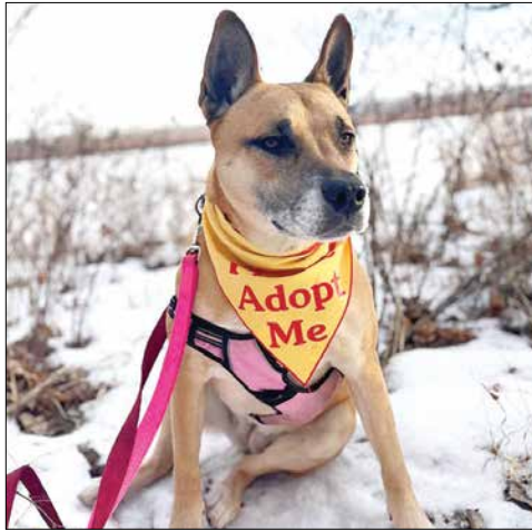
Working to help more dogs like Daphne find new families.

The overall plan is primarily dog kennel, but as this project moves in phases, we expect to increase our cat capacity as well. The current Admin/Cat building is beautiful, functional