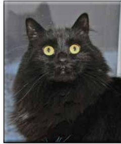
HEMATITE Spayed Female Long Hair (DLH) Black Approximate DOB: April 2020