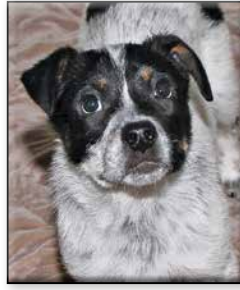
GROVER Neutered Male Blue Heeler Mix Approximate DOB: September 2024