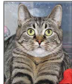
STARBURST Spayed Female Short Hair (DSH) Brown Tabby Approximate DOB: October 2022