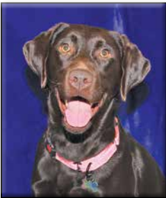
DEXTER Neutered Male Chocolate Lab Approximate DOB: July 2022