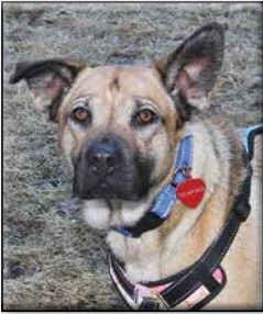
CEDAR Spayed Female German Shepherd Mix Approximate DOB: November 2023