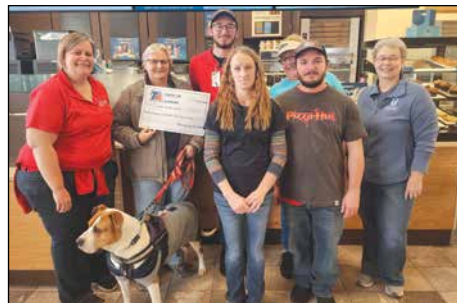
Generous Coffee Cup Travel Plaza staff present a check.

👏 A huge Thank You to the Coffee Cup Travel Plaza Steele ND for the donation of more than $3,600! The employees donate their tips to support community nonprofits. What an amazing gift and what amazing folks who give from the heart!