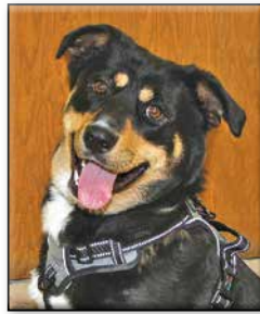
INGRID Spayed Female Shepherd Mix (Tri Color) Approximate DOB: January 2024