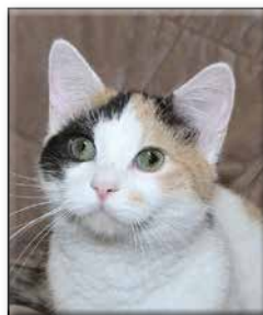
MIA Spayed Female Short Hair (DSH) Calico Approximate DOB: July 2024