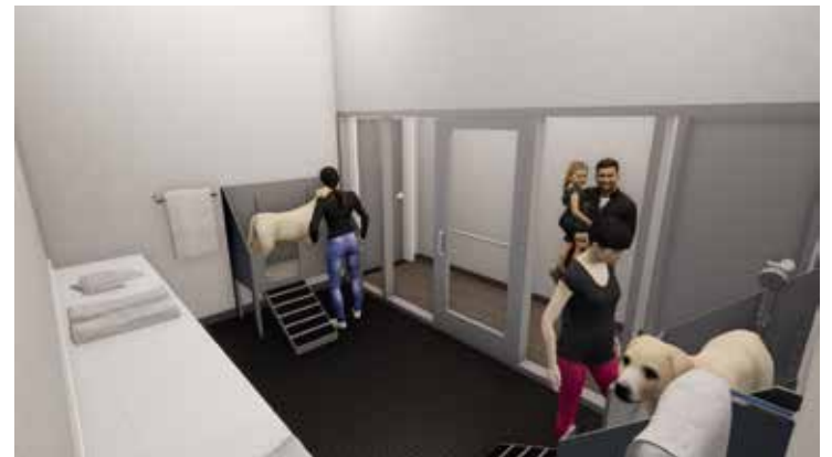
SHELTER DOG WASH