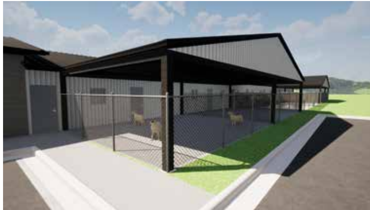
OUTDOOR PLAY YARDS